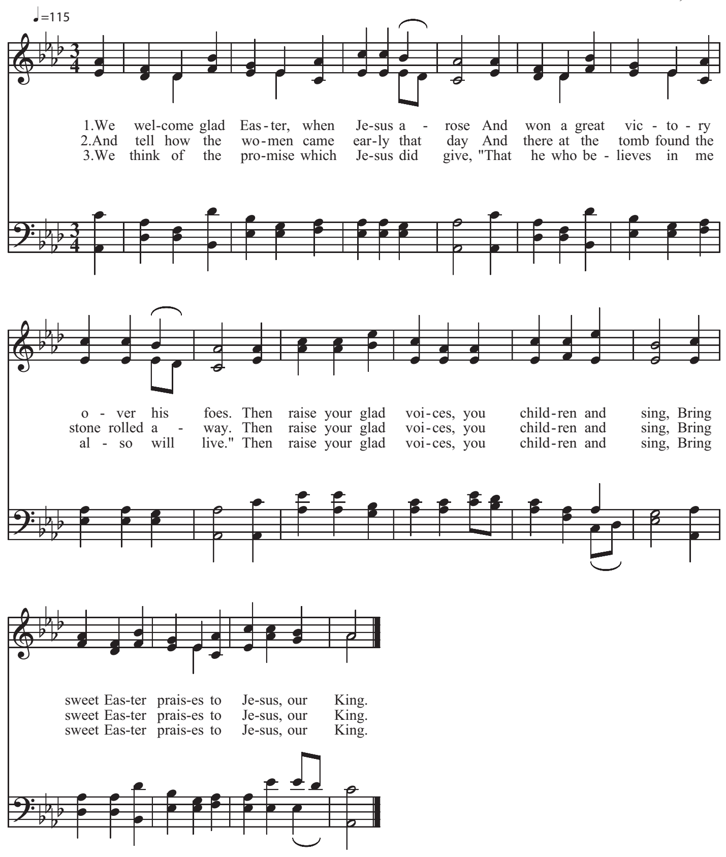
Public Domain Courtesy of the Cyber Hymnal (http://www.cyberhymnal.org)